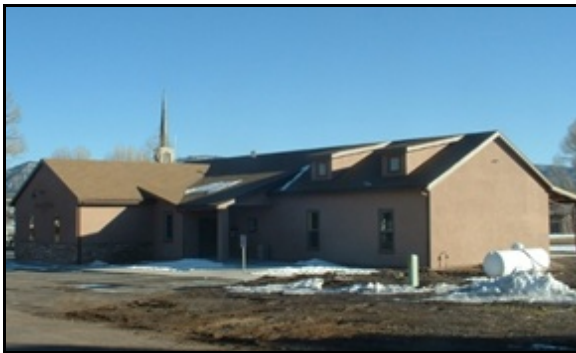
Geothermal Heating and Cooling at the town of Hatch Community Center - 2015