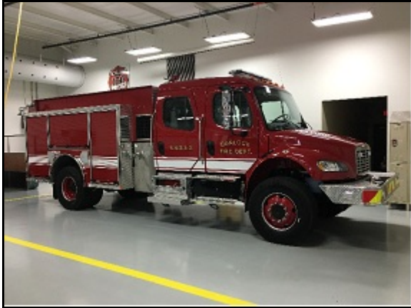
4x4 Fire Pumper Truck for Gunlock area -2016

Here are two recent CDBG assisted projects in this region: