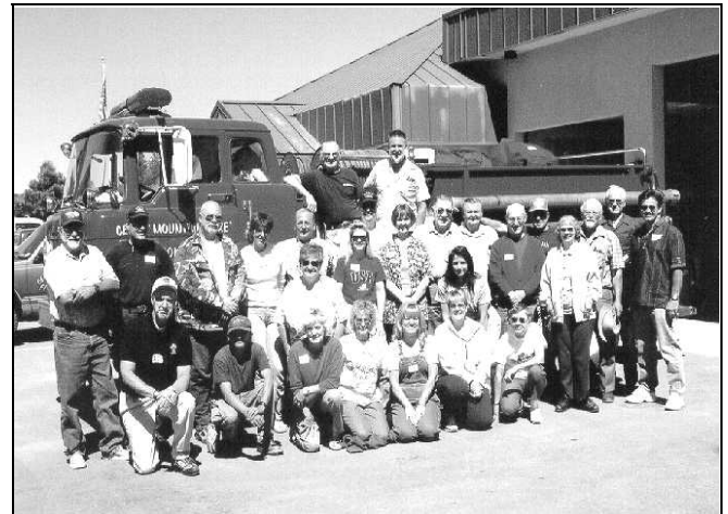
Participants of Training Workshop, August 9-10, 2002

Through the Western Urban Interface portion of the National Fire Plan, qualifying communities located in the urban rural interface are eligible for state and federal grant assistance for education and fuel mitigation programs.