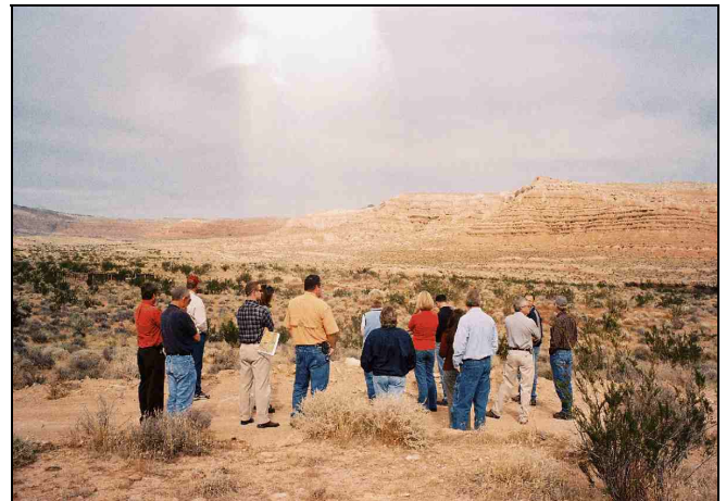
Group looking north from the field trip destination in the desert area west of Bloomington in St. George City.

BLM Field Office, State Trust Lands Administration, as well as InterPlan the consulting firm preparing the corridor study.