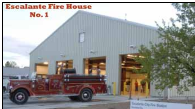
Escalante Fire Station prior to Open House Event

His leadership resulted in a complicated funding package using federal, state, county and local monies for the long-awaited Escalante City Fire Station #1. Although his term of office was over, he has continued to retain his Fire Chief position and oversaw the completion and occupancy of the Fire Station in May of 2010.