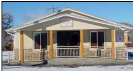
Ivan W. Kazan Memorial Clinic - Escalante, Utah

During his term of office, he oversaw the replacement of the Escalante Health Clinic through the use of insurance funds, volunteer labor and donated materials.