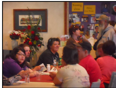
Washington County Public Forum 2011

Throughout the months of March and April, Five County Community Action Partnership (CAP) facilitated public forums throughout the five county region. Five County CAP utilized the collective strength of key community partners to address the causes and