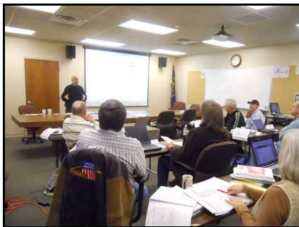
VITA volunteer Training 2011

Five County Community Action Partnership (CAP) sponsors Volunteer Income Tax Assistance (VITA) Programs in all five counties. This is the sixth year for VITA sites to offer free income tax preparation to low-income individuals.