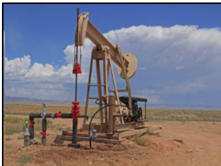
An oil well on BLM land in Grand County, Utah

At the tutorial, the presenters will discuss 'who can apply?', 'when can you apply?', 'what are CIB Trimesters?', 'what are eligible projects?', 'how to apply?' and 'what comes next after being funded?', such as reimbursement procedures. Any new CIB policies, procedures and requirements will also be discussed.