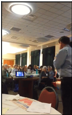
Last year's conference