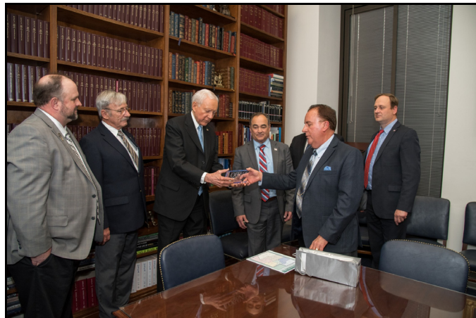
Presentation of "2018 NADO Congressional Partnership Award" to Senator Orrin G. Hatch on March 20, 2018, in Washington, DC

Senator Hatch has earned many titles over his years serving in the U.S. Senate. When I worked for him in Washington D.C. at the time he was Chairman of the Senate Judiciary Committee, and I always refer to him as the "Bicentennial Senator" from Utah because he was first elected to the U.S. Senate in 1976,