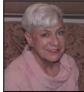
February 1953 - March 2016