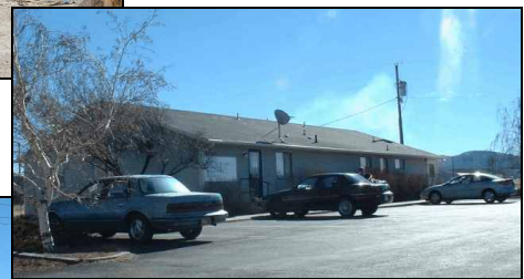
Enterprise Medical Clinic