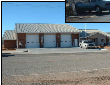
Hurricane City Fire Station Brentwood Area