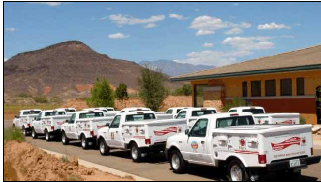
Meals on Wheels Delivery Trucks

(See Back Page for How-to-Apply Workshop Information)