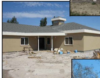
New Milford Senior Citizen Center Under Construction