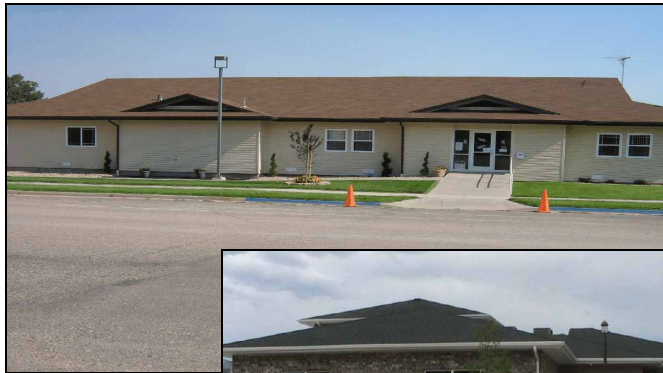
Cedar Senior Citizen Center Expansion