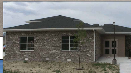
Antimony Community Center