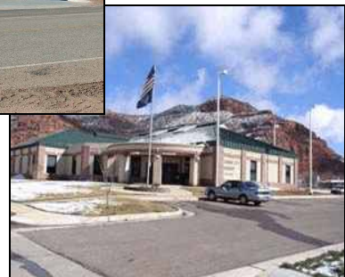
Kanab City Library