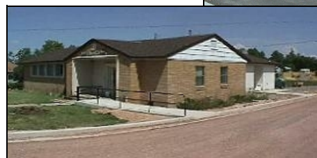
Enterprise Senior Citizen Center