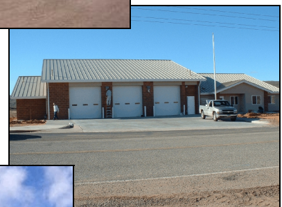
Hurricane City Fire Station Brentwood Area