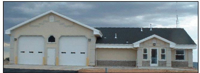
Iron County Ambulance Garage Parowan Valley

(See Back Page for How-to-Apply Workshop Information)