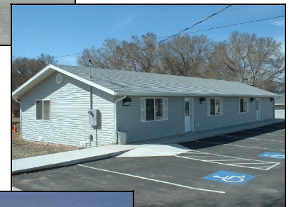
Minersville Senior Citizen Center