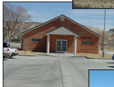
Cannonville Medical Clinic/Town Hall