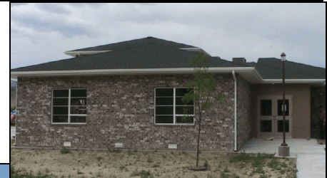
Antimony Community Center