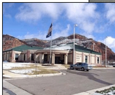
Kanab City Library