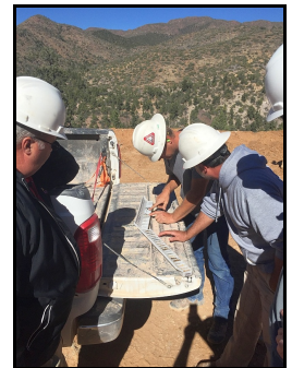
Examining chip samples.

I share this with you because I have always had the attitude that I can always learn more from other people, and I love it. Through this tour I was able to connect the geology students attending Southern Utah University with Libertygold and this spring those students will be able to conduct economic geology research while earning school credit and will contribute in a small way to the continued exploration by Libertygold in the area, and the overall economy of the county.