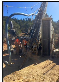
Close-up of the drilling rig.

that area I became somewhat familiar with those general surroundings since back when I was a teenager. This was the first time I have heard from professional geologists that at one time the Goldstrike area looked like current day Yellowstone National Park. The ground today certainly has changed, and of course we don't have the water that flows in Yellowstone today.