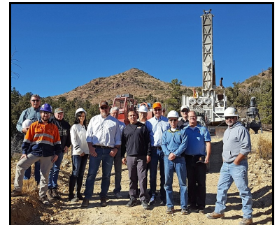
Visit to the site of a reverse circulation drilling rig.

Last November, I, along with with Washington County commissioners and representatives of Libertygold (the owners of the Goldstrike mine on the west side of Washington County), toured that area of the county. Because our family owned land in