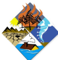
Hazard Mitigation Plan

In our November-December 2016 edition of this Newsletter we reported the Federal Emergency Management Agency (FEMA) was reviewing the final draft of a regional Multi-jurisdictional Natural Hazard Mitigation Plan developed by the Association staff in collaboration with all the cities and five counties, and almost all of the towns in the region.