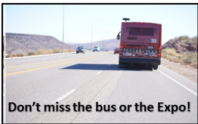
Don't miss the bus or the Expo!

The Transportation Expo typically attracts attendance by over 600 people who come to find out about the state of transportation in Utah's Dixie. Come and ask questions of community and agency representatives and learn about current projects and future transportation needs in your own neighborhood and greater community.