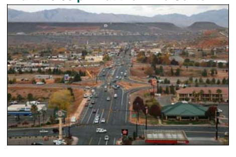
Tuesday, February 9, 2016 10:00 a.m. until 6:00 p.m. at the Dixie Center

Growth occurring in Washington County has brought about tremendous changes to nearly every aspect of this once mostly rural portion of Utah. Despite the recent economic downturn during