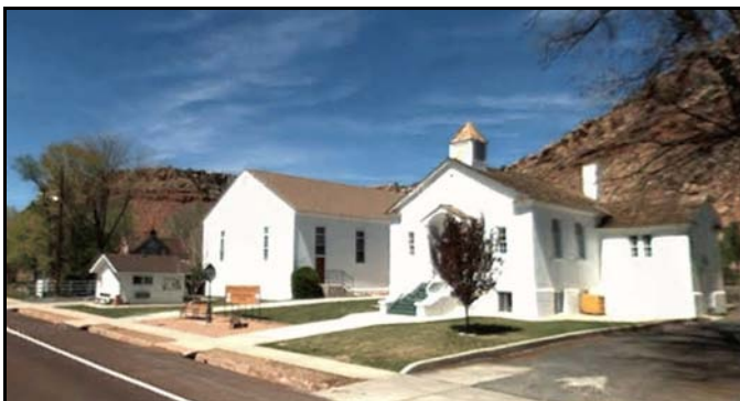
Rockville Community Center

Town leaders have continuously budgeted for repairs and upgrades to the facilities. They have replaced both roofs, added central heating and cooling to the main hall and have repaired the stucco exteriors and painted both buildings.