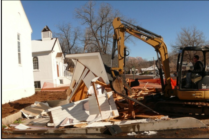
Site demolition began on January 3, 2011 to make way for new Rockville town office addition

Work began on January 3, 2011 to make room for a new town office addition in front of the Rockville Town Community Center recreation hall structure. As of January 17th framing of the facility was underway.