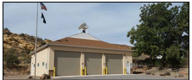
Northwest Special Service District Gunlock, UT Fire Station