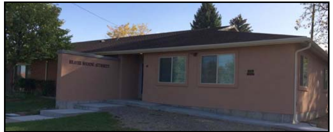
Beaver Housing Authority Program Delivery Office in Beaver